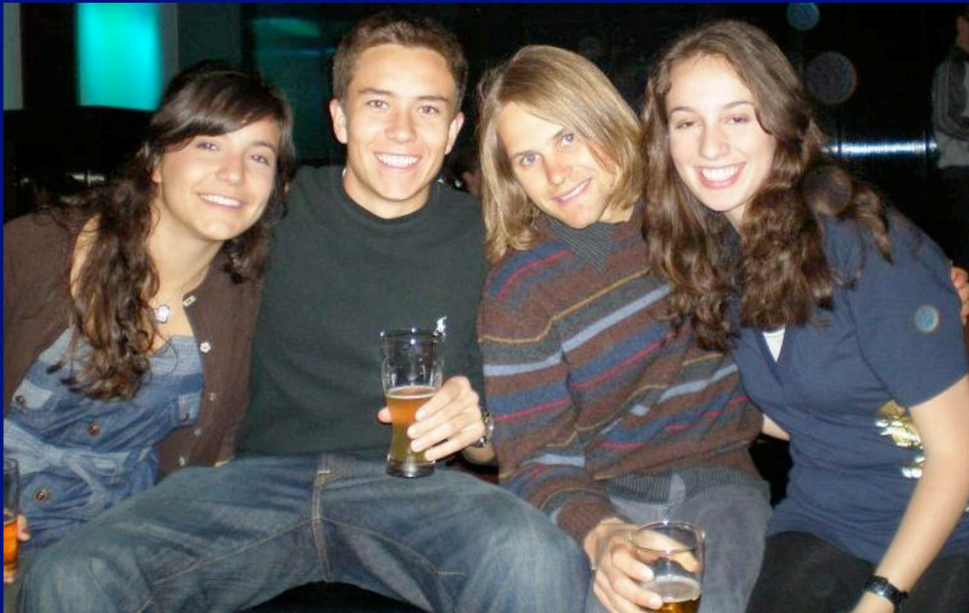
Out on the town