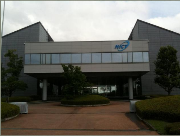
Where we work