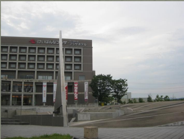
On our way home(50 minutes walk) Huge clock in front of the ATR building