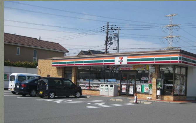
Japanese 7-11 📱 📞